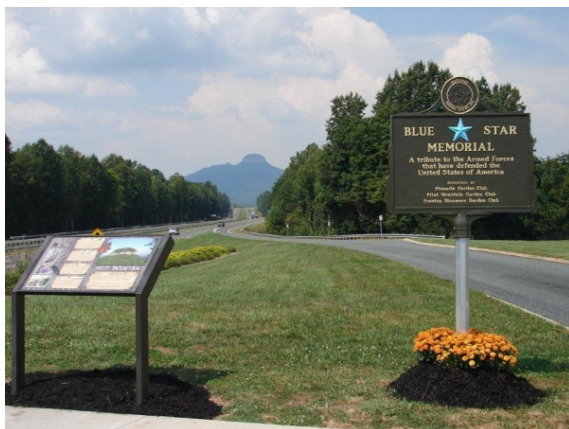
Pilot Mountain Blue Star Memorial, dedicated 2013